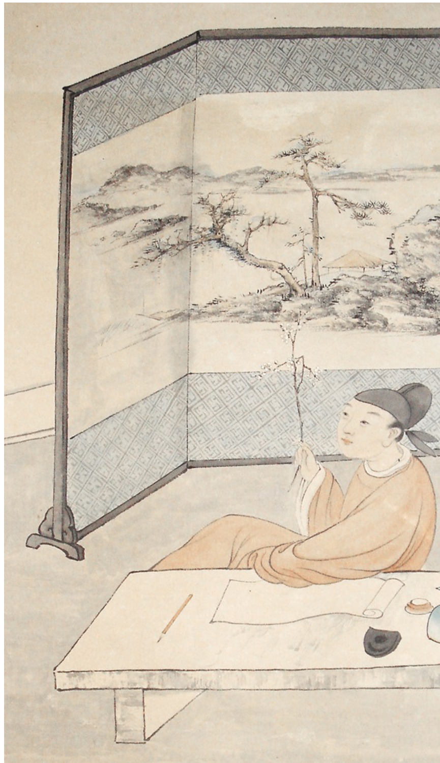
Xie Zhiguang (1899-1976), Appreciating the Plum Blossom , Hanging scroll, ink and color on paper, 53.5 x 11.75 in (136 x 30 cm)