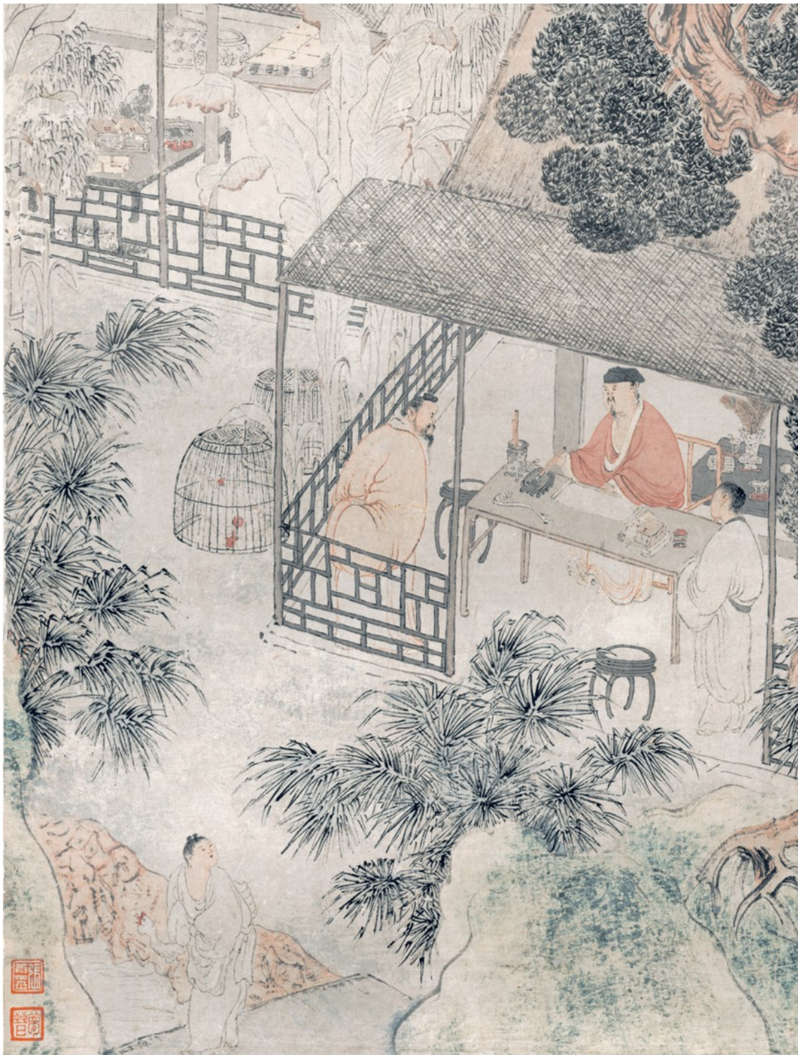
Zhang Ling (late 15th - early 16th century, Ming dynasty), Exchanging the White Goose for the Classic Text , Framed, ink and color on paper, 27 x 10.5 in (68 x 26.8 cm)