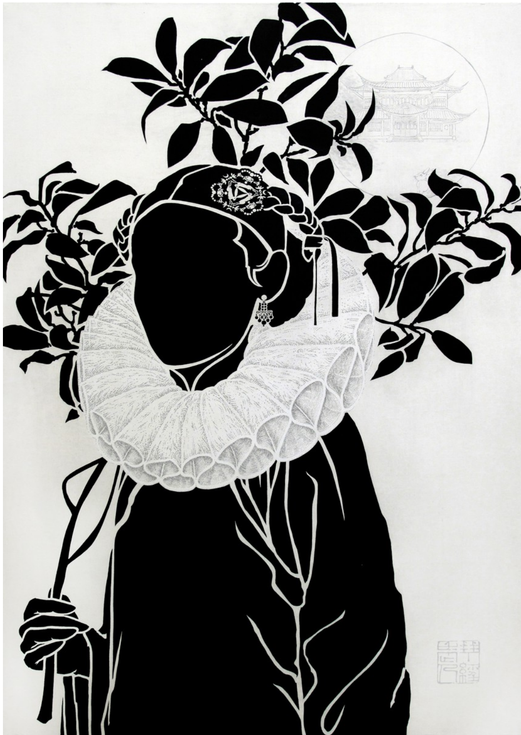
Annysa Ng , Moon on Laurel, 2013, Acrylic on silk, ink on Xuan paper, 42 x 30 in (106.7 x 76.2 cm)