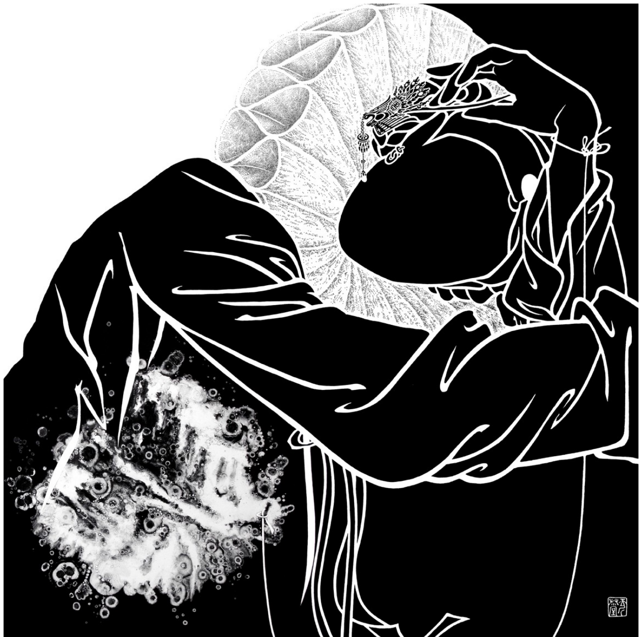
Annysa Ng , Embrace Nothingness II , 2014, Ink and acrylic on canvas, 40 x 40 in (101.6 x 101.6 cm)